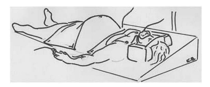
Figure 2 Spinal immobilisation tilted. Adapted from Battaloglu et al.<sup>60</sup>

In order to achieve a sufficient patient tilt to alleviate SHS, any wedge or alternative should be placed below any spinal immobilisation devices wherever possible (see figure 2).<sup>60</sup> Also, the wedge should support the length of the spinal immobilisation device in order to be a stable platform and prevent hinging